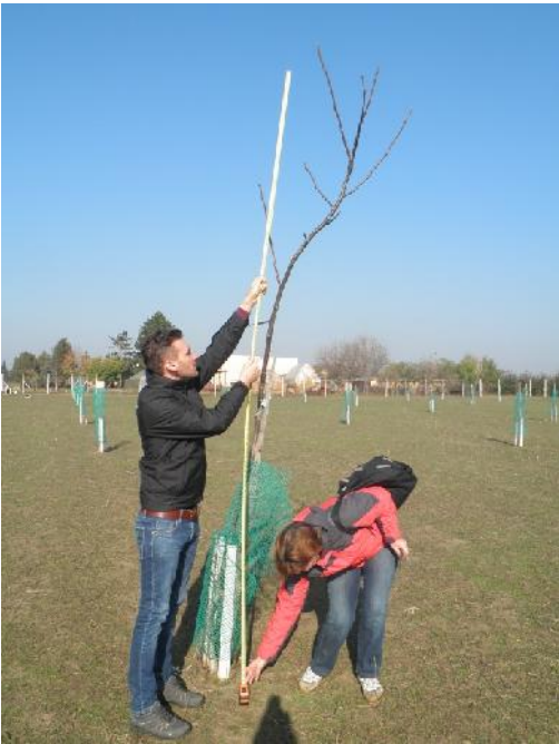
Fig. 3. Tree height of 'Miroslava' walnut cultivar (RSFG Iasi, Romania, October 2015)